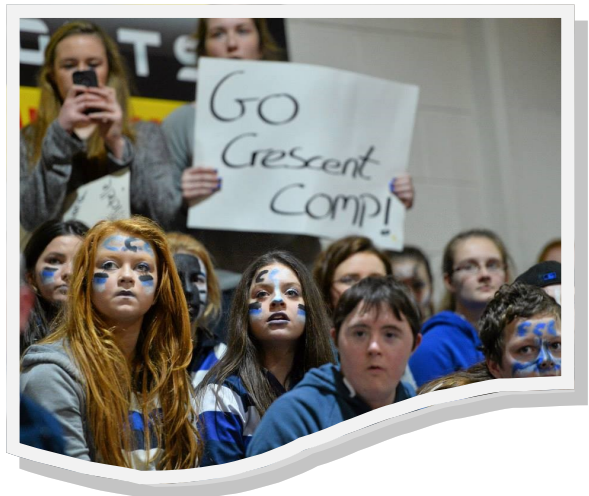
The Fans Looked on go Jack!!!!