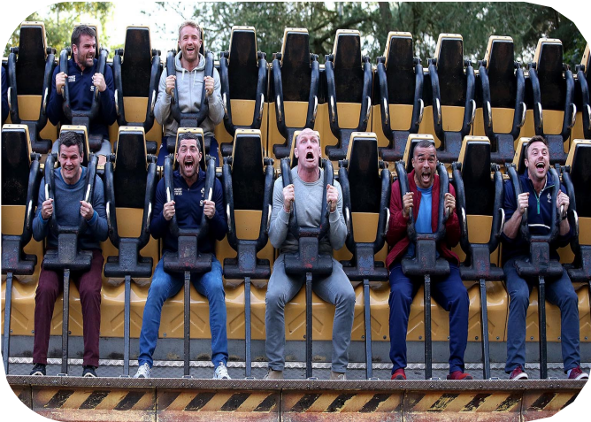
The Irish Team take some time off at Alton Towers

As the World Cup is upon us, many people are asking the question how Good are Ireland's Chances? The Irish team has a long history of bad-luck in the World Cup having never made it past the Quarter Final stages. The team of 2007 were considered to be our best but they flopped, struggling even to beat Georgia in the group stages. The team of 2011 had far less experience but outperformed the team of 2007, beating Australia in the group stages only to be beaten by Wales in the Quarter Finals.