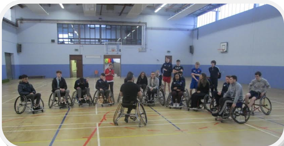
Students in TY trying out the wheelchairs