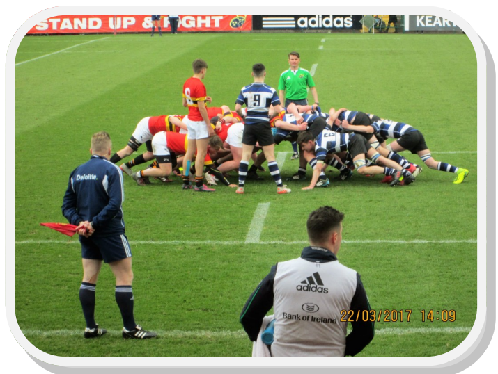
Crescent College v CBC