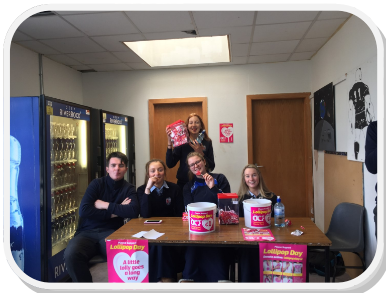
Transition Years selling lollipops for Lollipop Day 2017