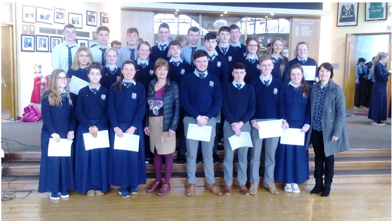
Crescent students with their DELF certificates presented at assembly

The Diplôme d'études en langue française (English: Diploma in French Language Studies), or DELF for short, is a certification of French-language abilities for non-native speakers of French administered by the International Centre for French Studies (Centre international d'études pédagogiques, or CIEP) for France's Ministry of Education. It is composed of four independent diplomas corresponding to the first four levels of the Common European Framework of Reference for Languages: A1, A2, B1 and B2. Above this level, the "Proficient User" divisions are certified by the DALF. The examinations are available in three varieties: "DELF Prim" which is for Primary school students (only available at A1 level), "DELF Junior et Scolaire" which is aimed at secondary-school aged students and "DELF Tous Publics" which is aimed at adults.