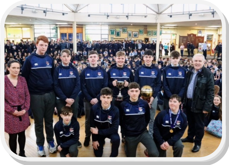
Back in school the boys are given a fantastic welcome from their fellow students, teachers, coaches and staff.